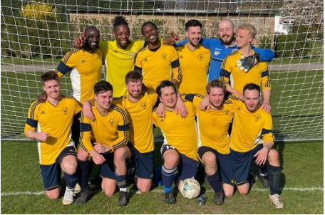
JUNIOR 2 SOUTH: Bank of England 3rd