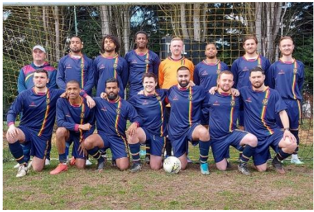
INTERMEDIATE NOVETS CUP: Old Wimbledonians