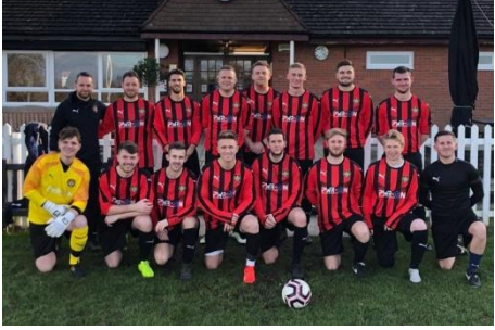
INTERMEDIATE DIVISION 3: Old Owens 3rd