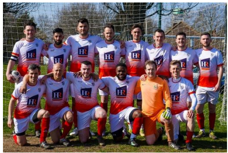
JUNIOR 2 NORTH: St. James' Old Boys