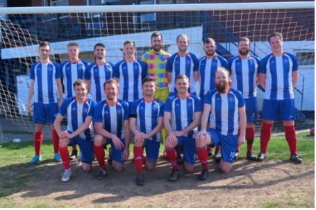
JUNIOR 1 SOUTH: Actonians Association 4th