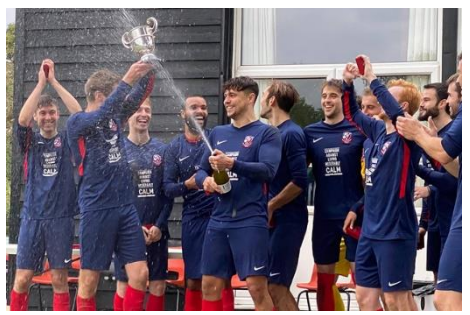
INTERMEDIATE CUP: Nottsborough Res