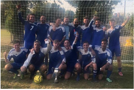
INTERMEDIATE NOVETS CUP: Broomfield 4th