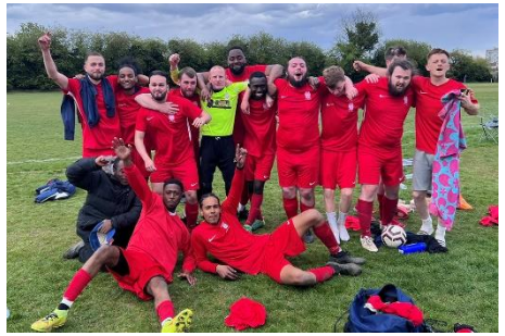
JUNIOR 4B NORTH: Norsemen 7th