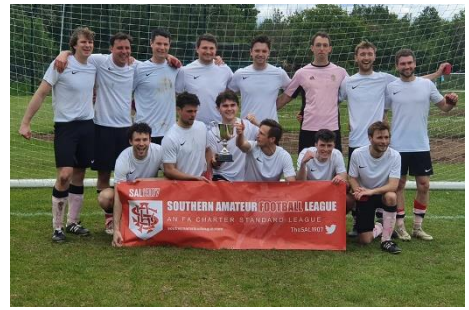
SENIOR CUP: Old Carthusians