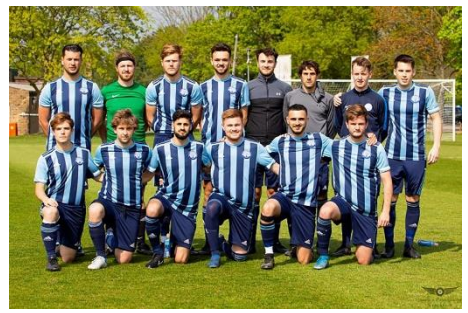
SENIOR DIVISION 1: West Wickham