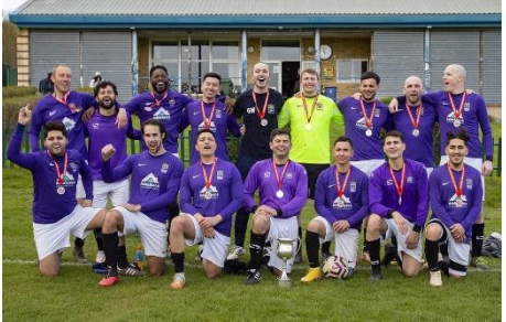
SENIOR NOVETS CUP: Winchmore Hill 6th