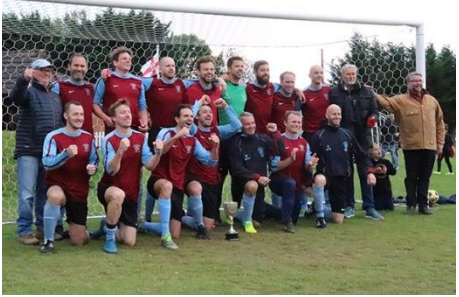
VETS SATURDAY SHIELD: Old Meadonians Vets