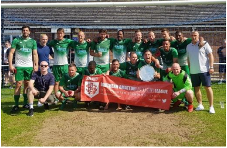
VETS SUNDAY CUP: Old Aloysians Vets