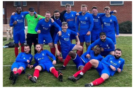
JUNIOR 1 NORTH: Norsemen 5th