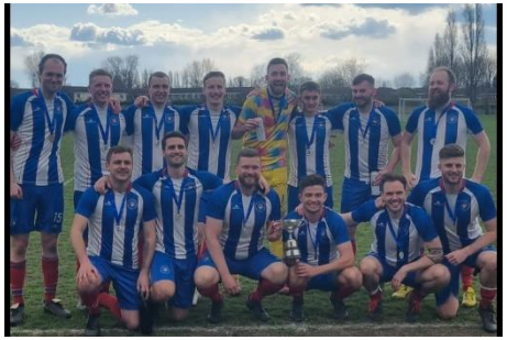
AFA MINOR CUP: Actonians Association 4th