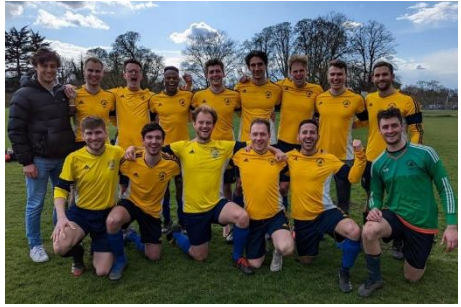
JUNIOR 3 SOUTH: Bank of England 4th