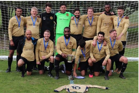
2019/20 AFA MIDDLESEX/ESSEX SENIOR CUP: Old Garchonians