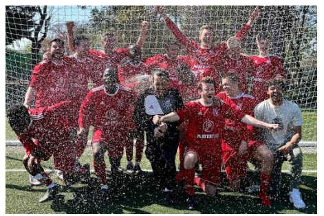
SENIOR DIVISION 3: Hammersmith

What do you want to see in the SAL Standard? Contribute or get involved at: