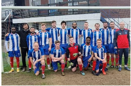
INTERMEDIATE DIVISION 2: Actonians Association Res