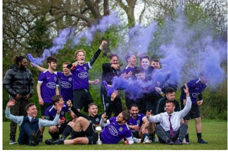
INTERMEDIATE NOVETS CUP: Little Heath