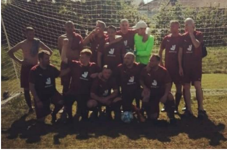
JUNIOR 4A NORTH: Crouch End Vampires 4th