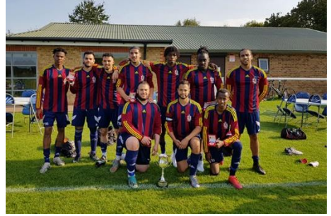
SENIOR NOVETS CUP: Old Lyonians 4th