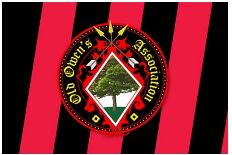
JUNIOR 3 NORTH: Old Owens 5th