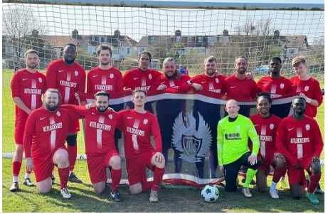
JUNIOR NOVETS CUP: Norsemen 7th