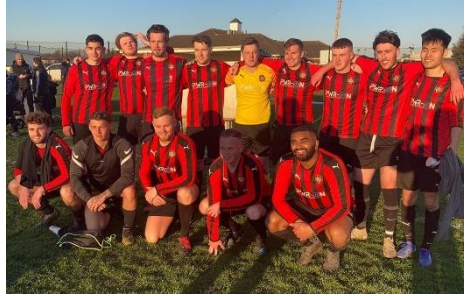
OLD BOYS JUNIOR CUP: Old Owens Res