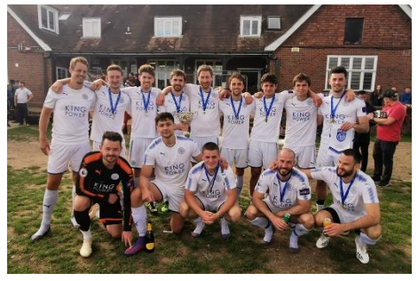
2019/20 AFA SURREY/KENT INTERMEDIATE CUP: Nottsborough Res