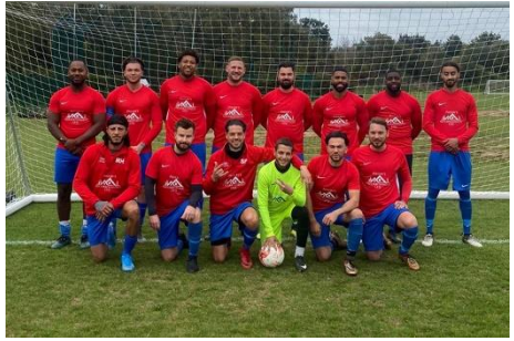
JUNIOR CUP: Alleyn Old Boys 5th