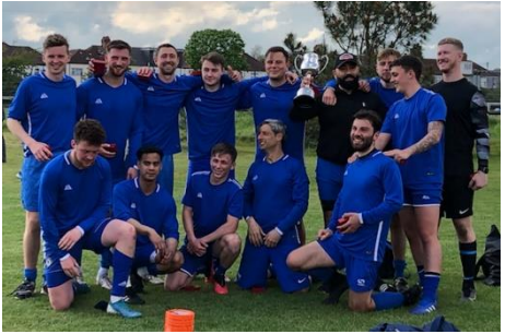
SENIOR NOVETS CUP: Broomfield 3rd