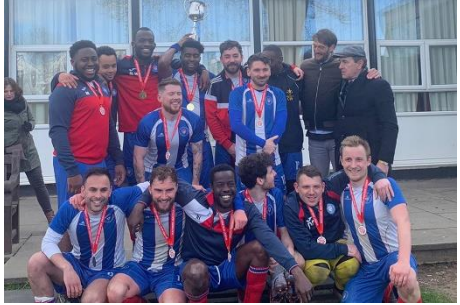
JUNIOR CUP: Actonians Association 3rd