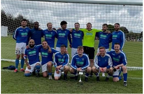
JUNIOR CUP: Broomfield Res