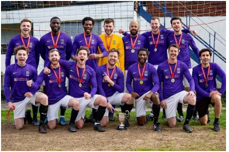
INTERMEDIATE CUP: Winchmore Hill 3rd