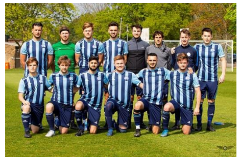
SENIOR CUP: West Wickham