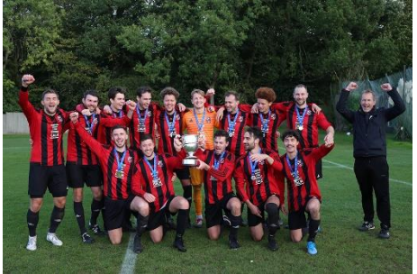
2019/20 AFA SURREY/KENT SENIOR CUP: Nottsborough