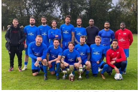
2019/20 LOB JUNIOR SOUTH CUP: Alleyn Old Boys 5th

What do you want to see in the SAL Standard? Contribute or get involved at: