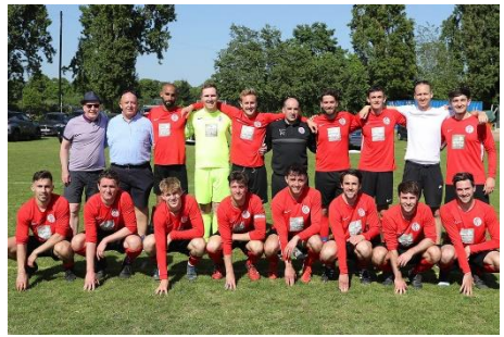
SENIOR DIVISION 2: Civil Service