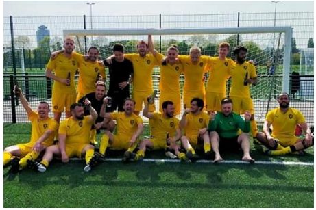
INTERMEDIATE DIVISION 4: Merton Res