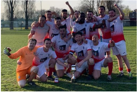
MINOR CUP: St. James' Old Boys