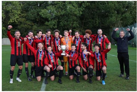
2019/20 AFA SENIOR CUP: Nottsborough