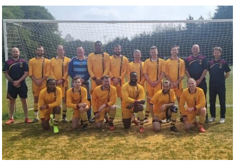
JUNIOR 6 SOUTH: Old Wimbledonians Res