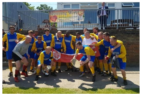
VETS SUNDAY CUP: Old Aloysians Vets