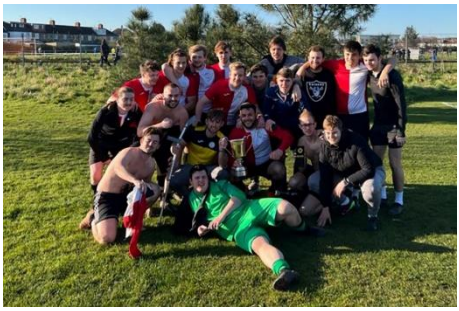
OLD BOYS 4TH XI CUP: Old Parkonians 4th