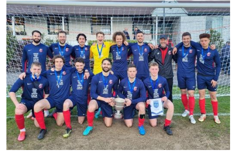
AFA SENIOR CUP: Nottsborough