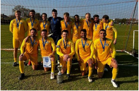
AFA INTERMEDIATE CUP: NUFC Oilers Res