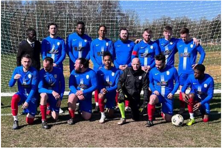
AFA INTERMEDIATE NOVETS CUP: Norsemen 7th