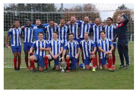
SENIOR CUP: Actonians Association